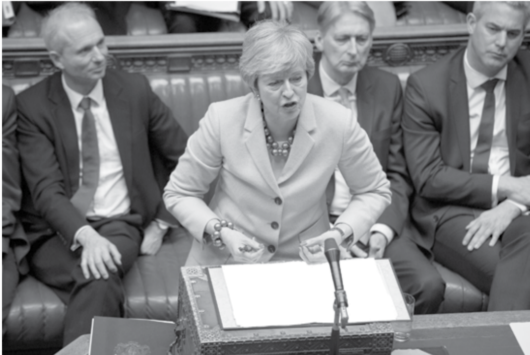
Britain's Prime Minister Theresa May making a statement in the House of Commons in London

Britain's parliament sought a new Brexit approach yesterday after seizing the initiative from Prime Minister Theresa May in a historic vote taken to stave off a looming "no-deal" divorce.