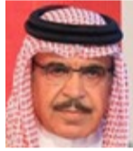
General Shaikh Rashid

Manama As part of the Royal vision to promote loyalty and patriotism, Interior Minister General Shaikh Rashid bin Abdullah Al Khalifa yesterday launched the National Plan to Promote the Spirit of Belonging to the Nation and Reinforce the Values of Nationalism. The event was attended by ministers, senior officials, religious scholars, members of the Council of Representatives and the Shura Council, presidents of universities and institutes, heads of schools, representatives of human rights organisations, editors-in-chief of newspapers, businessmen, lawyers, doctors, owners of majlis and heads of sports clubs and youth centres.