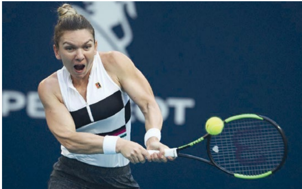
Simona Halep of Romania plays a point against Venus Williams

The world number three and number two seed for the tournament triumphed in straight sets