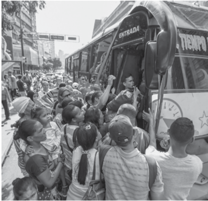
People queue to get on a bus during a partial power cut in Caracas

Cellphone signals were disrupted and television was blanked out. Shops hastily low-