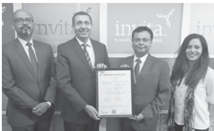
During Invita's PCI-DSS standard certification ceremony