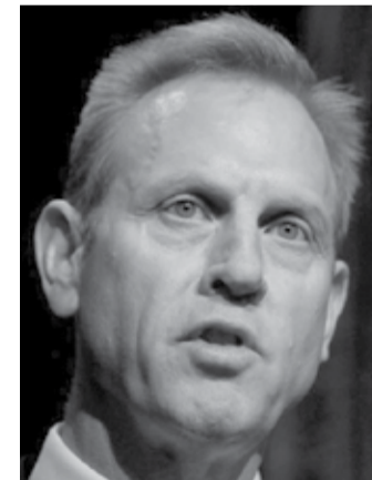
Acting Pentagon chief Patrick Shanahan