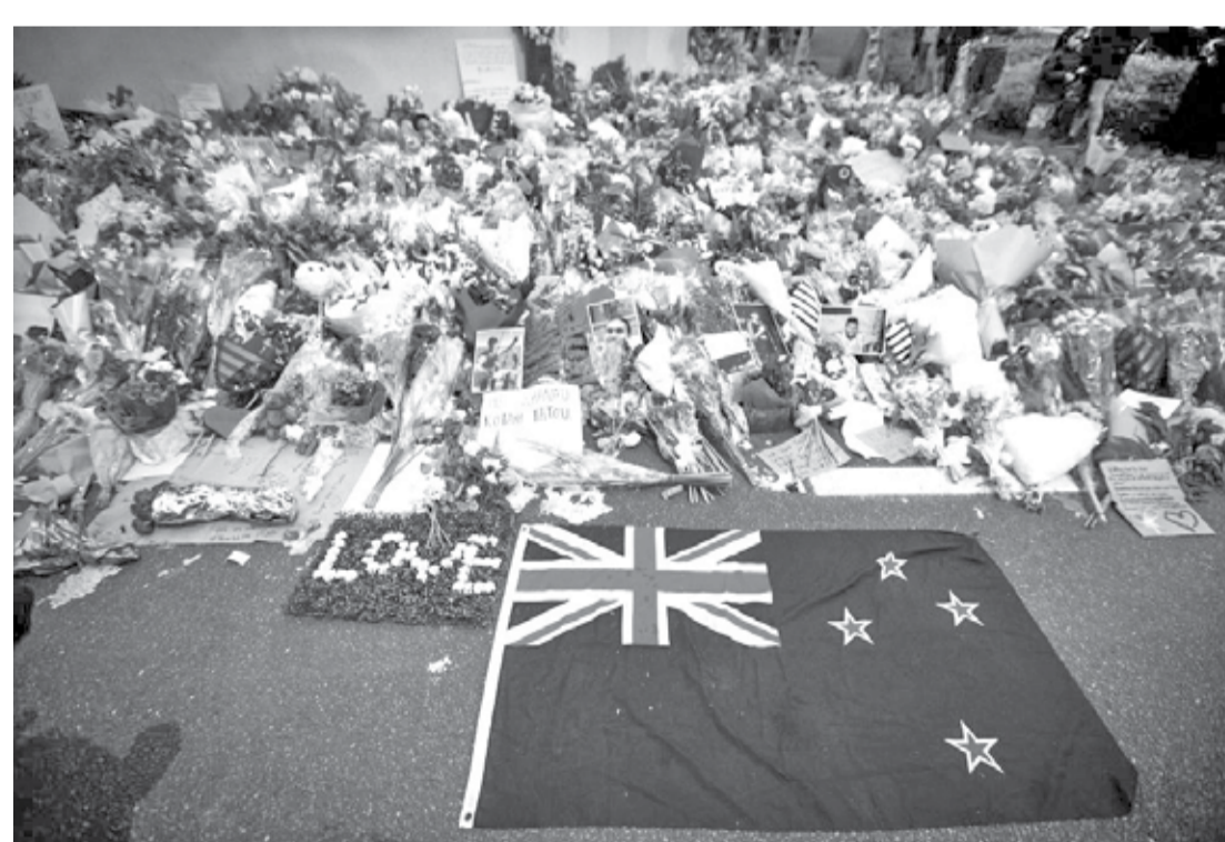
50 Muslims were killed by Brenton Tarrant in New Zealand.