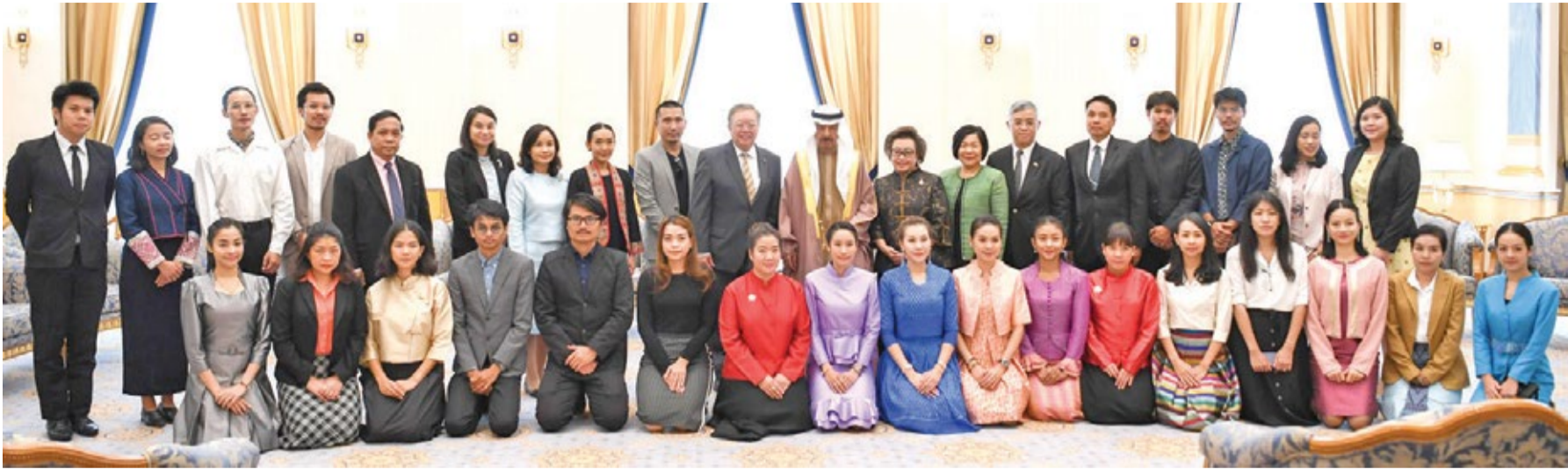
His Royal Highness Prime Minister Prince Khalifa bin Salman Al Khalifa praised strong and growing relations of friendship and co-operation between Bahrain and Thailand, which are based on mutual understanding and respect. He stressed the Kingdom's keenness to further bolster bilateral co-operation to achieve common interests mainly in the economic, trade and investment fields. HRH the Premier was speaking as he received at Gudaibiya Palace yesterday Advisor to the Thai Foreign Minister Chaisiri Anamaran who is on a visit to Bahrain leading a delegation comprising economic and cultural figures. HRH the Prime Minister hailed the visit of the Thai delegation to Bahrain which is part of the efforts made to promote bilateral co-operation.