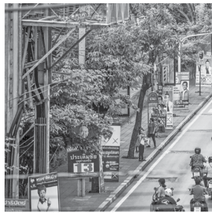
Campaign posters lining a street in Bangkok.

The Northeast represents about one-third of the country's population of more than 68 million, and for nearly two decades the way the Northeast has voted,