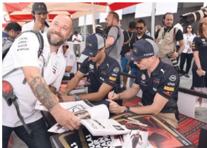
Racegoers during autograph session at BIC (file photo)