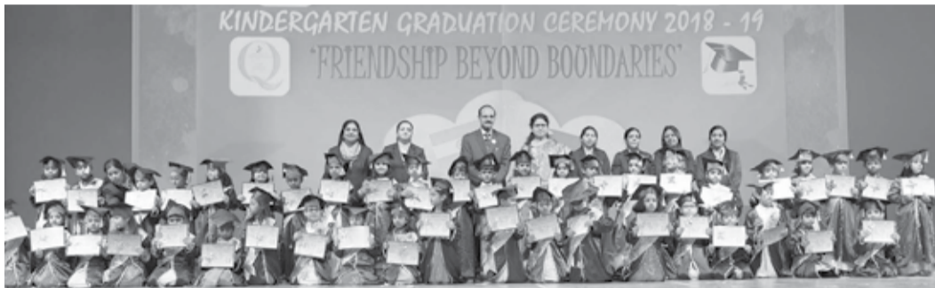
Kindergarten students of The New Millennium School with their certificates during the Graduation Ceremony

2018-19 were applauded and felicitated for their commendable academic performance and 100 per cent attendance in the year. The parents of the students were present to witness the ceremony.