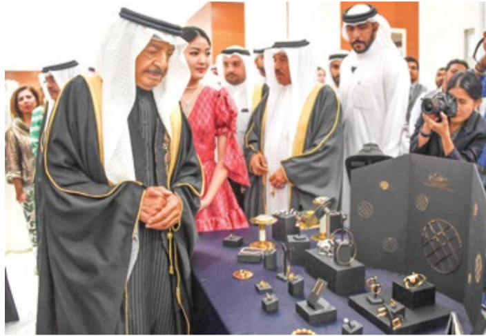
HRH the Premier tours Thai Culture and Food Festival.

HRH the Premier was received on arrive at the festival by Advisor to the Thai Foreign Minister