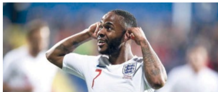
England's forward Raheem Sterling celebrates after scoring the fifth goals of his team

Manchester City's Sterling celebrated the visitors' fifth goal by cupping his ears towards the home fans on a night when another impressive performance to start Euro 2020 qualifying by the Three Lions was overshadowed.