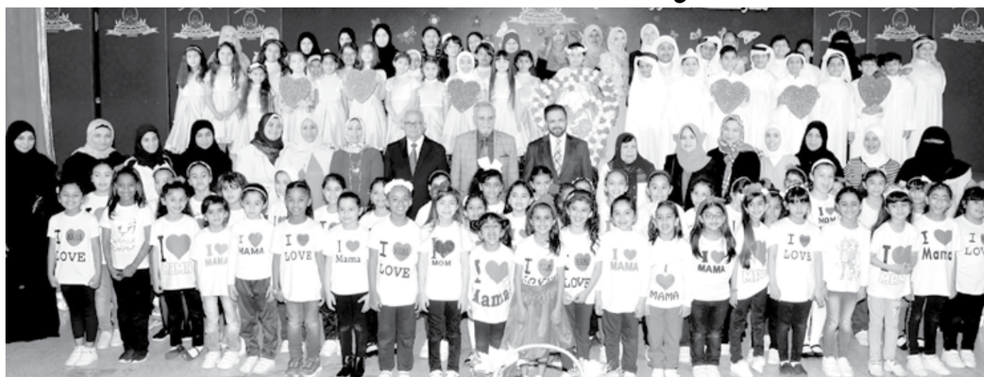
Al Noor International School students and staff during Mother's Day celebration