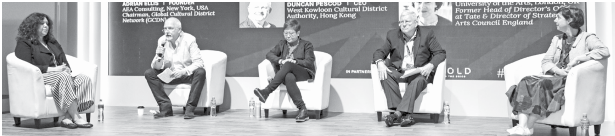
Many international speakers talked about art and commerce, technology and the impact of AI and blockchain on art.

ArtBAB initiative is being held in collaboration with Tamkeen