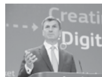
Andrus Ansip, vice president of the commission

The Commission did not call on European countries to follow the example of the US, Australia or Japan in banning deals with the firm, but it will