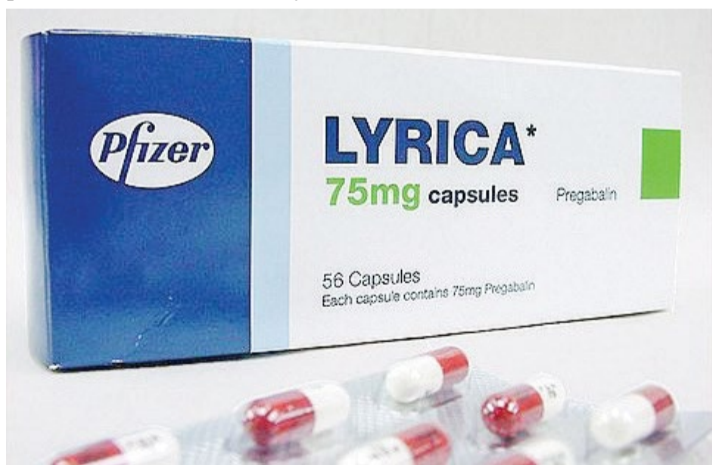
Lyrica tablets were allegedly sold by the students at the public school.

The Public Prosecution will announce its findings as they unfold, in accordance with the provisions of the Law, and in a way that would not affect the course of investigation, he added.