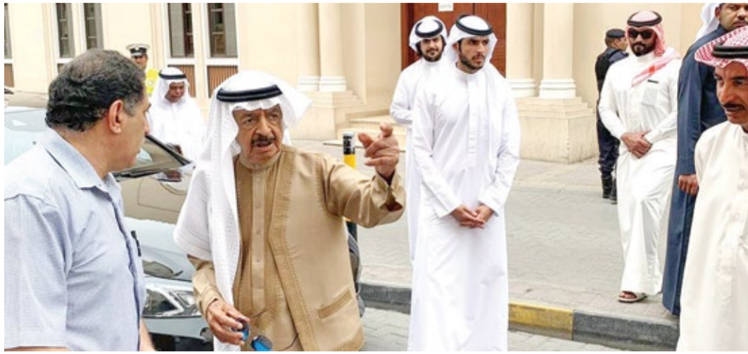
HRH the Premier during an inspection visit to heritage and religious sites.

HRH the Premier highlighted the government's unwa-