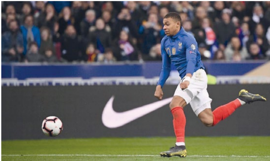
France's forward Kylian Mbappe runs with the ball

In Group A, England, fresh from a 5-0 demolition of the Czech Republic in which Ra-