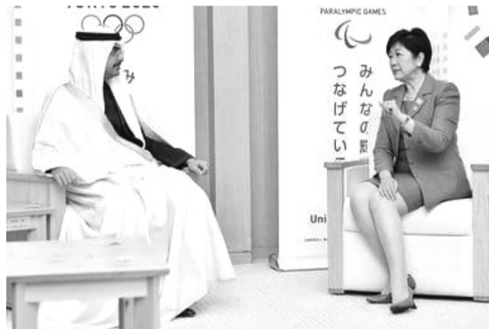
Yuriko Koike receives Shaikh Khalifa.

The Southern Governor pointed out the industrial, educational and cultural projects that have been established in the Southern Governorate, thanks to the directives of HM King Hamad bin Isa Al Khalifa, HRH Prime Minister Prince Khalifa bin Salman Al Khalifa and HRH Prince Salman bin Hamad Al Khalifa, Crown Prince, Deputy