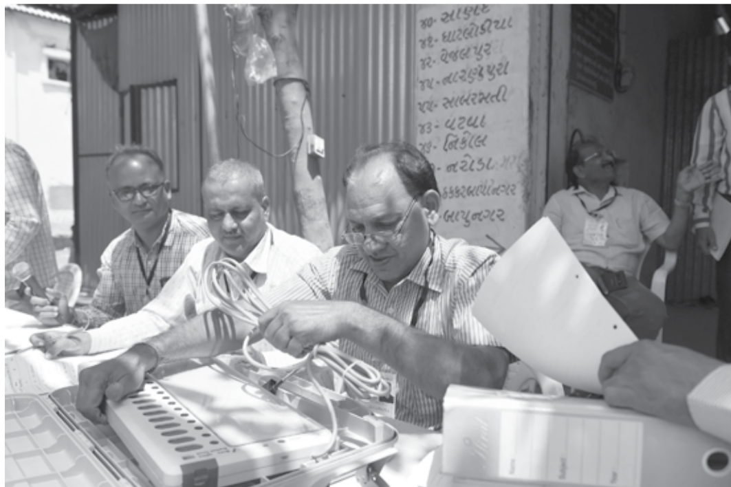
Indian election officials test and prepare Electronic Voting Machines (EVM) at a distribution centre ahead of the Indian elections in Ahmedabad

So far, authorities have confiscated 4.4 million litres of liquor