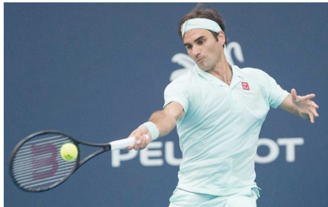
Roger Federer of Switzerland celebrates plays a point against Filip Krajinovic of Serbia

"He's clever how he plays the court because he can play it up and down, and he's unusual when he plays from back," said the Swiss, who hit 14 aces and won an impres-