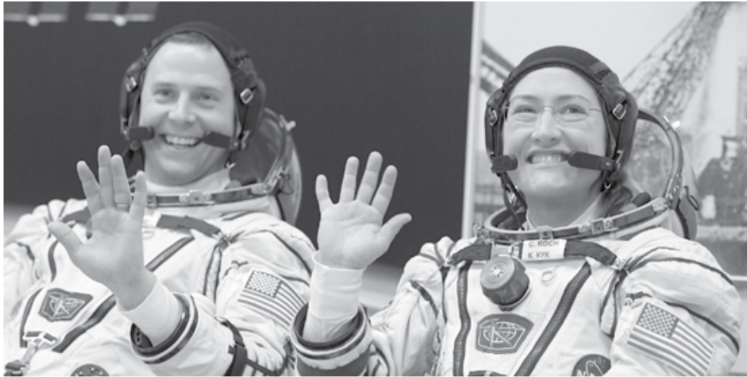
NASA astronauts Christina Hammock Koch and Nick Hague, members of the International Space Station (ISS) expedition 59/60, react shortly before the launch onboard the Soyuz MS-12 spacecraft from the Russian-leased Baikonur cosmodrome in Kazakhstan

Until now, male-only or mixed male-female teams had conducted spacewalk since the space station was assembled in 1998 -- 214 spacewalks until now.