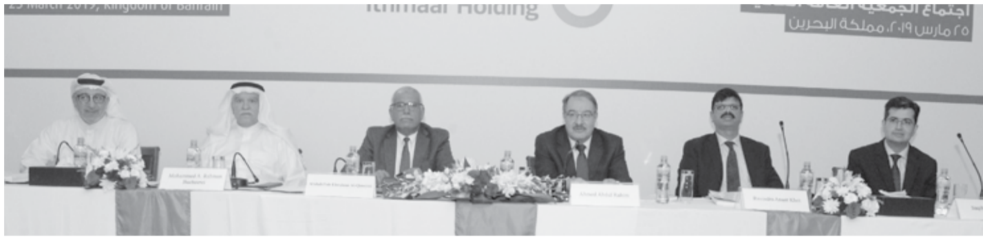
Ithmaar Holding officials during the Annual General Meeting (AGM) held yesterday

Two major shareholders of Ithmaar holding's, according to reports, are Islamic banks Dar Al Maal Al Islami Trust and Islamic Investment Company of the Gulf