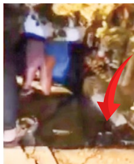
A screenshot of the video showing soccer fans digging a tunnel to make their way to the stadium.

However, the relentless fans "engaged in an adven-