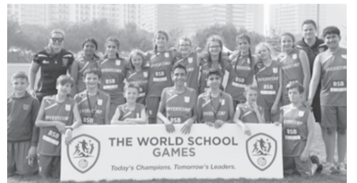
BSB students during the World School Games in Dubai