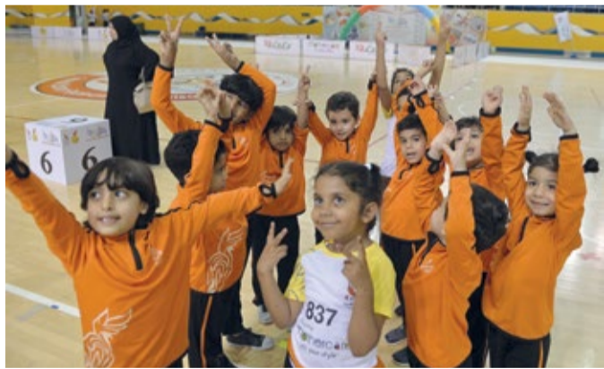
Kids in action during previous year's Baby Games