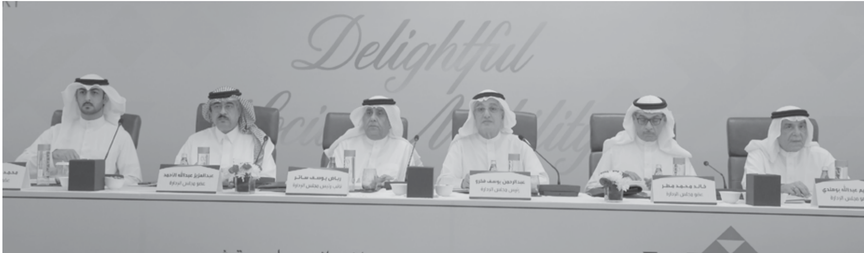
BCFC board members, officials during an Annual General Meeting held yesterday